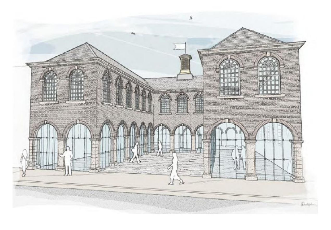
Image A - FWCH (a restored option; image courtesy of Ian Tod Architects)