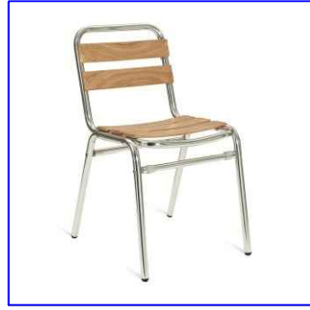
New furniture 470W X 580D