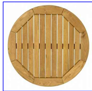
Timber table tops 700mm di