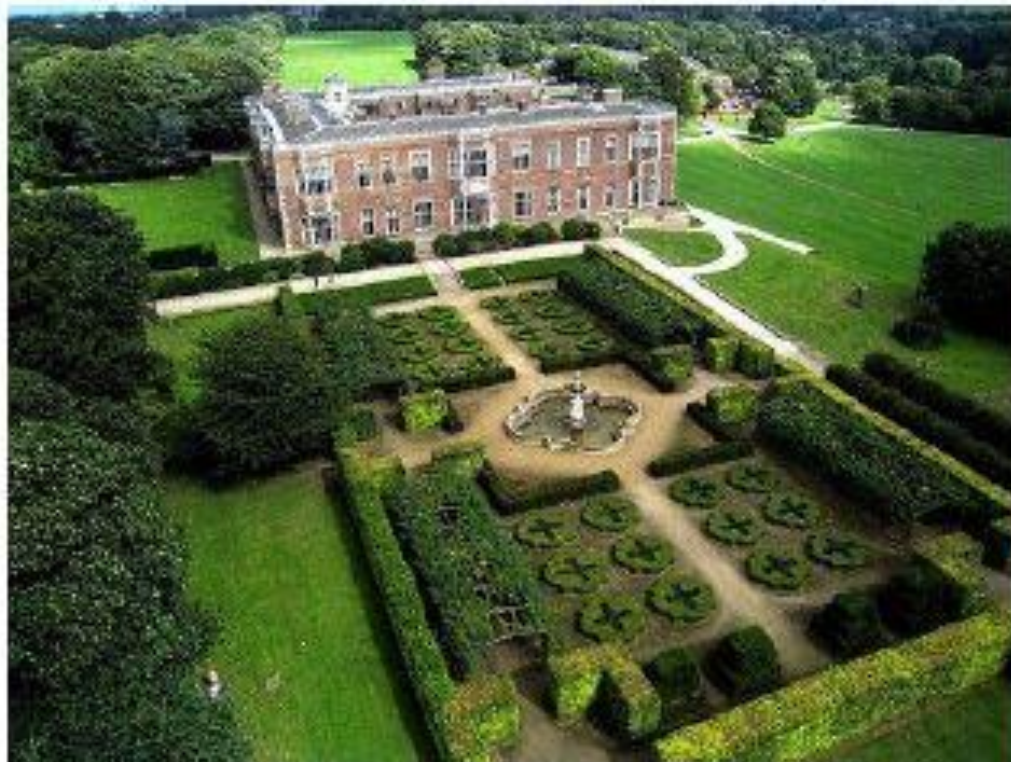
Temple Newsam House hosts this Outer East Community Committee session

Death is a difficult subject but, whatever your age, one we will all need to face at some point. The session being held by the Outer East Community Committee on Tuesday 12th September will offer a chance to talk about related topics in a relaxed atmosphere.