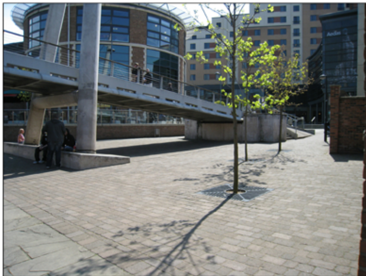
View looking east towards Brewery Wharf.

Materials, styles and colours should be selected to complement the existing character of the space and ensure the defence integrates visually, as well as physically, with the existing landscape.