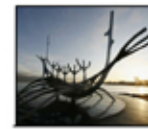
Sculpture and art incorporated into defences.