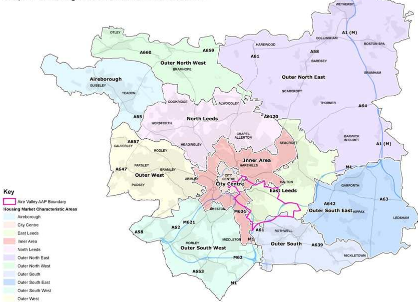
Map 2. Housing Market Characteristic Areas