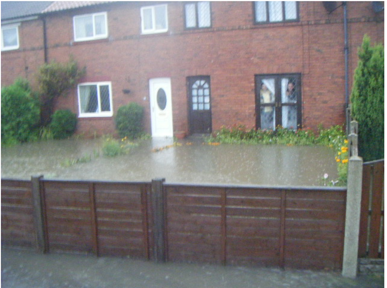
Figure 1 – Flooding in Leeds Road – Allerton Bywater August 2014