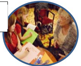
Leeds Grand Theatre The Fashionable Lounge