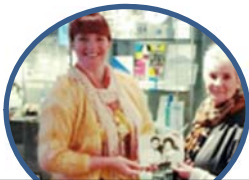
Abbey House Museum and The Vintage Youth Club Decades of youth