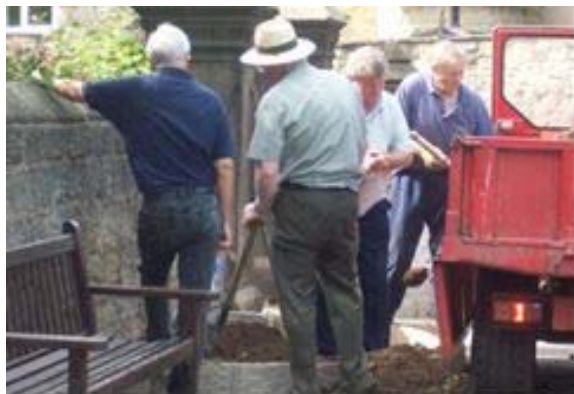
In bloom volunteers

The majority of 'In Bloom' volunteers are aged 60+. During 2017 Leeds was very successful in the Yorkshire in Bloom competition including receiving gold medals and being the category wins for the city of Leeds, City Centre, Barwick in Elmet, Kippax and Horsforth. Several of the local parks also won awards including Horsforth Hall park, The Hollies, Churwell Urban Woodland and Cross Flatts park which all won platinum (the highest) awards.