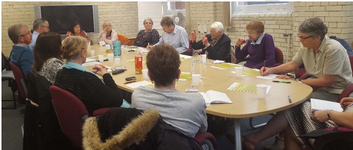
SHMA older people's workshop

A Strategic Housing Market Assessment (SHMA) was undertaken through a household survey to understand the housing needs of Leeds up to 2033. As part of this assessment the consultants ran a workshop was to explore older persons housing requirements to feed into the SHMA and complement the household survey and stakeholder consultation.