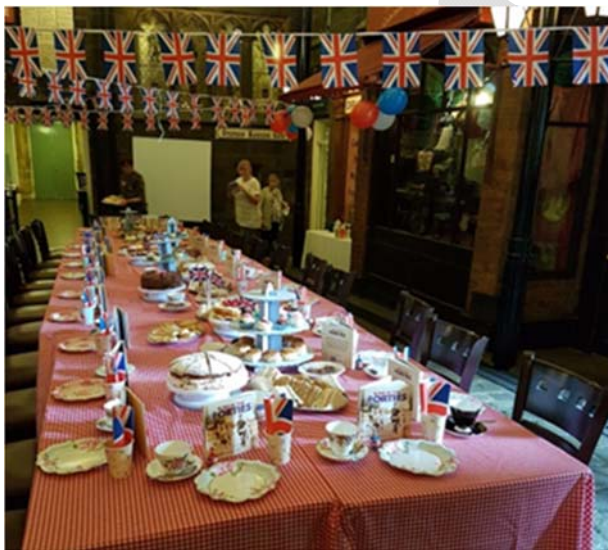
25 people attended a 1940's themed street party the Abbey House museum with a slide show, objects to reminisce over, singing and afternoon tea.

The Sociable History Club and the 1152 Club at Leeds City Museum and Kirkstall Abbey which provide regular opportunities for people over 55 to meet and enjoy talks and presentations on a wide variety of local history topics. The clubs now attract up to 40-50 people for each session.