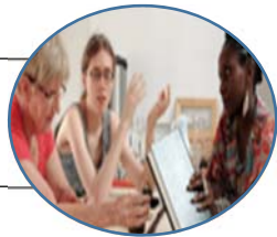
The Writing Squad Second hand stories