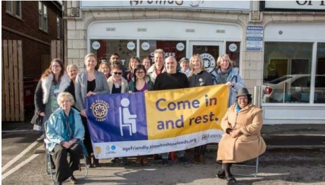
The Come in and Rest scheme officially launched on 25 January 2018

Generations United is a new publication, produced by Leeds Older People's Forum, showcasing these amazing intergenerational projects across the city. The report was officially launched on 25 September at the LOPF Celebration Event.