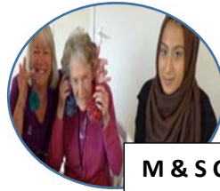
M & S Company Archive Sparkling Memories