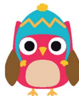
Winter Friends' owl

Winter Friends is a public health initiative which has been ongoing in Leeds for the past three years. It is a citywide network of professionals and organisations all aiming to prevent excess winter deaths and reduce cold weather related illnesses among vulnerable people in our communities, with a particular focus on older people through the use of the winter wellbeing checklist and other free resources.