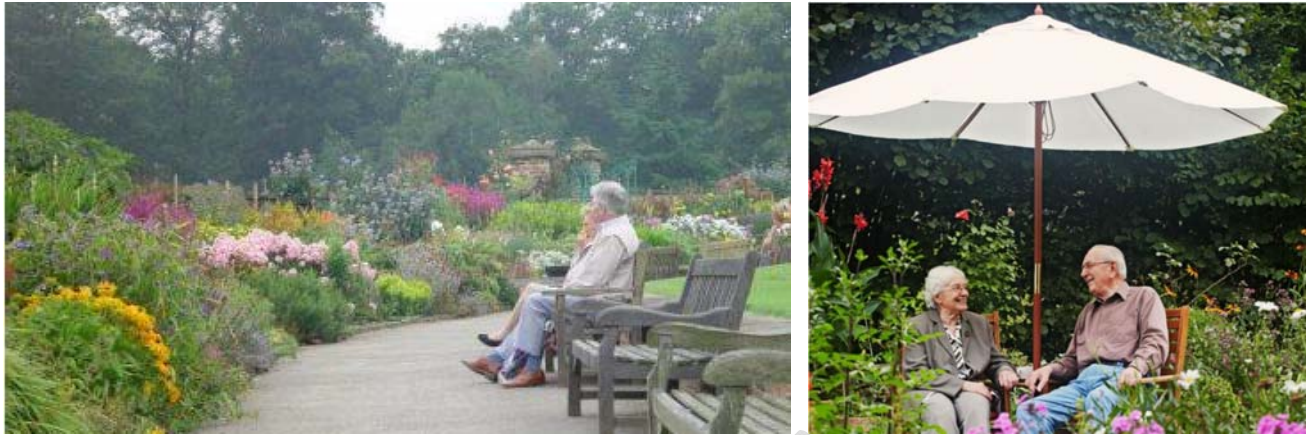
Dementia Friendly Garden, Rothwell

Older people are one section of the population benefiting from work to improve access at a number of parks and open spaces including: