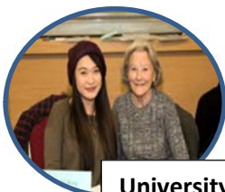
University of Leeds Writing Back

Generations United is a new publication, produced by Leeds Older People's Forum, showcasing these amazing intergenerational projects across the city. The report was officially launched on 25 September at the LOPF Celebration Event.