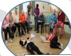
Fall into place Community Theatre Generation Squad