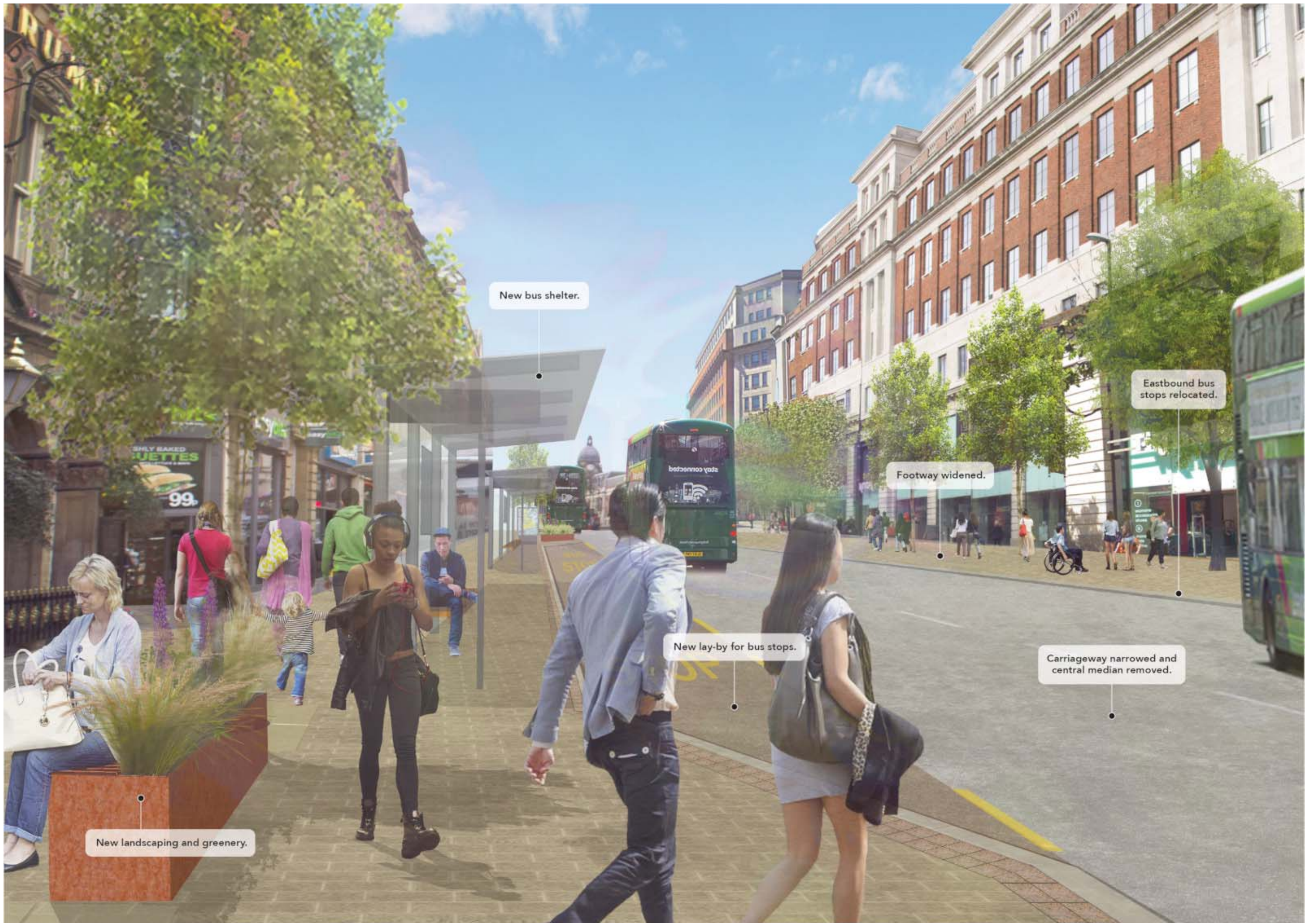
New bus shelter.