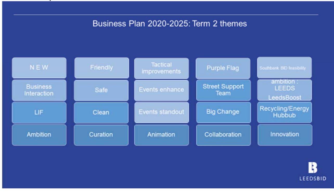
Table below provides more information

3.11 LeedsBID services in the second term would not seek to duplicate roles and activities that are already undertaken by others. This will enable clarity of roles and support a collaborative approach with the City Council to maximise outcomes for the City centre.