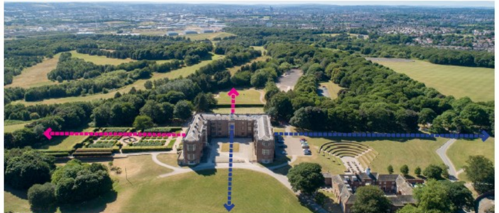
Present day - Drone Photography

Obscured Views The landscaping of Capability Brown removed the original formal gardens leaving open views to each aspect of the House. Views and vistas form key elements in the design of the landscape.