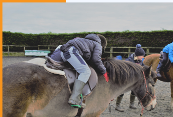
Think Like A Pony

Improve their self-esteem through engaging in new experiences, meeting new people and making new relationships