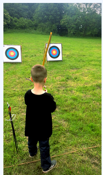
Beavers Fun Day