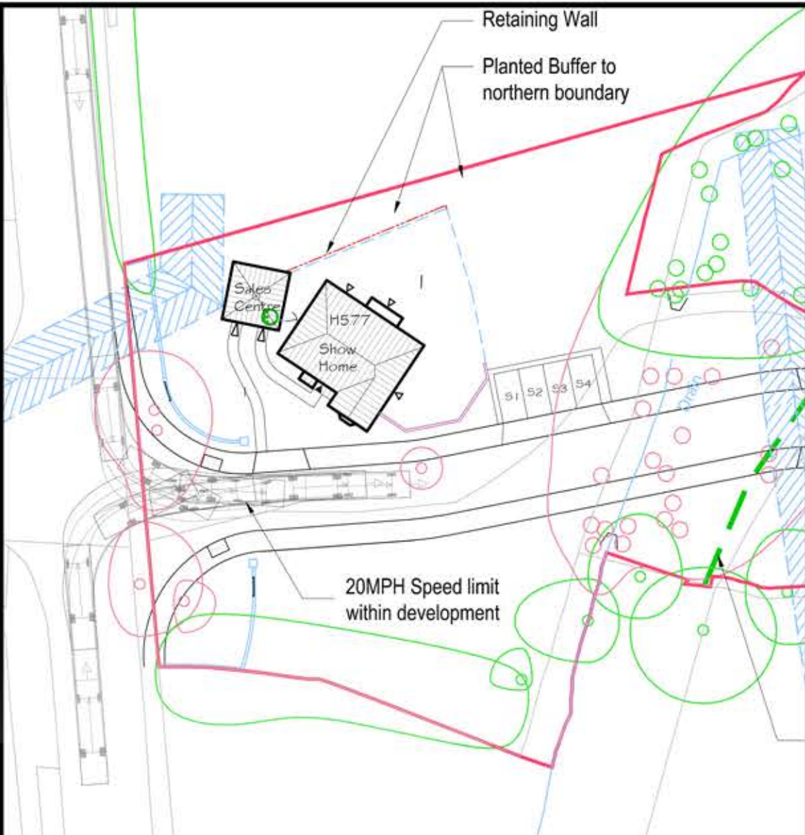
SALES AREA EXTRACT (1:500 SCALE)