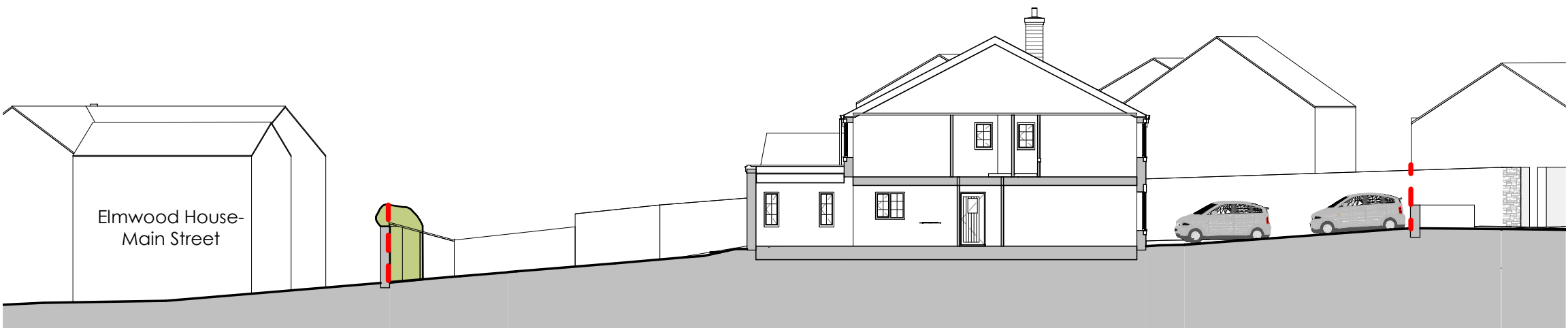
Section A-A 1:200