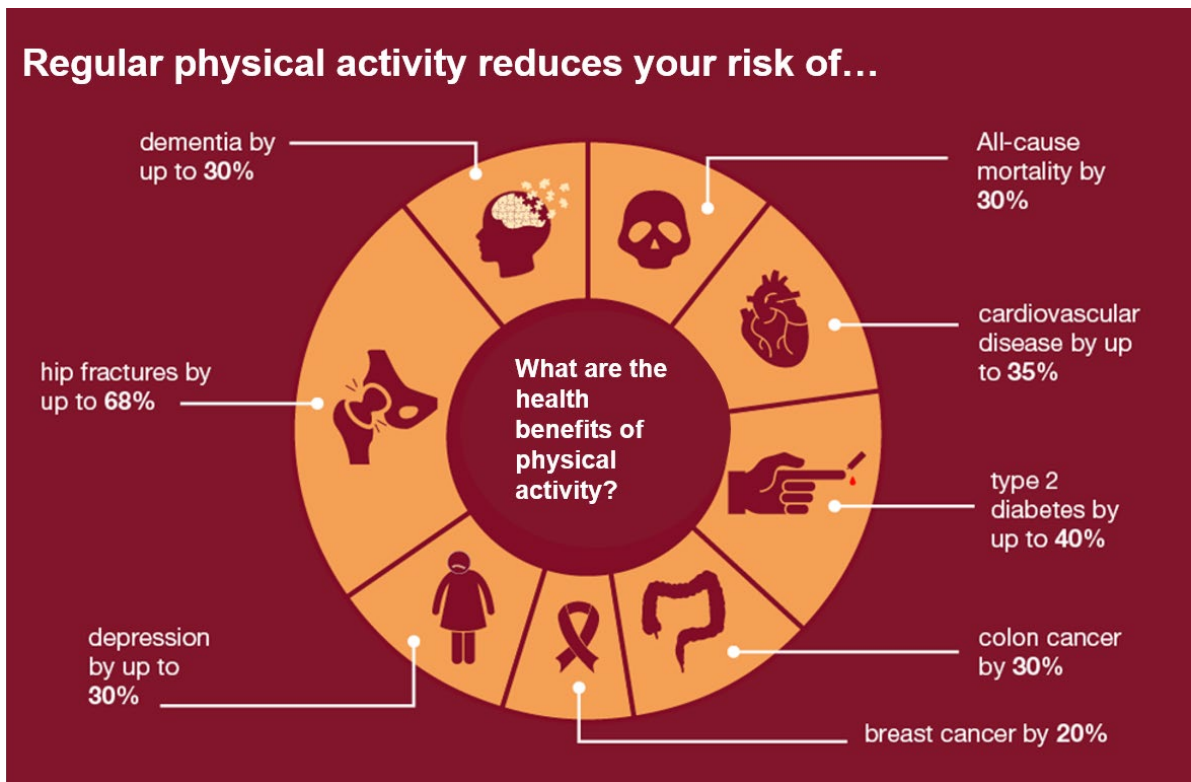
Figure 1: The health benefits of physical activity