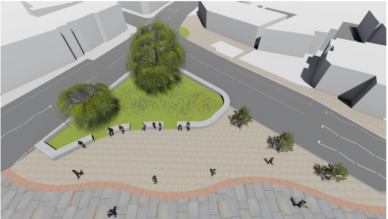
Visual 3 – Ariel view of proposed scheme area