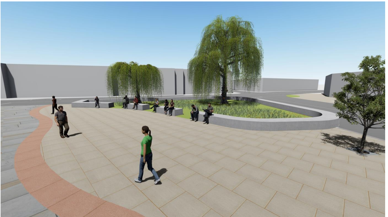
Visual 2 – Looking towards the Harrogate Road/Stainbeck lane junction