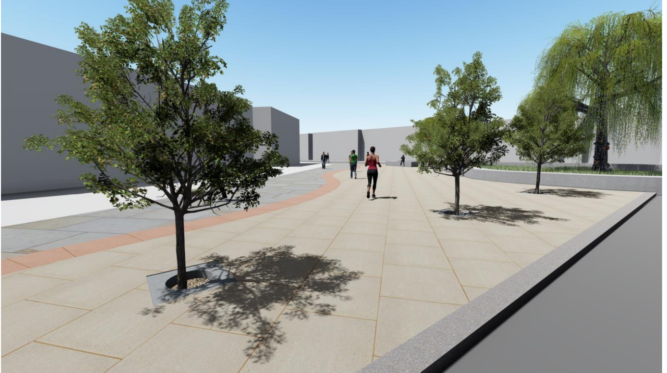
Visual 1 – Stainbeck Lane looking towards Harrogate Road