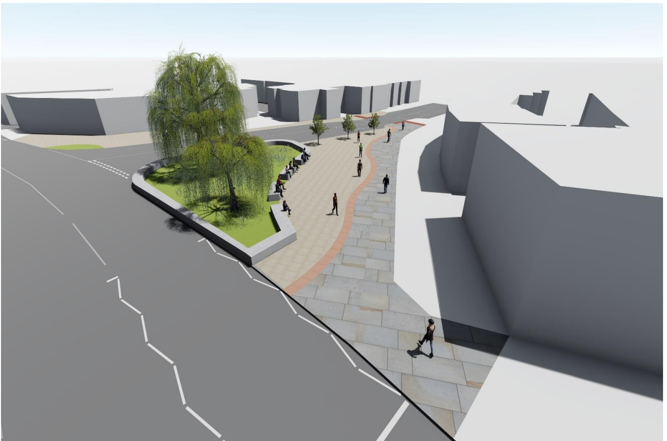
Visual 4 – Ariel view from Harrogate Road