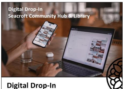
'Get Online. Get Connected.' Seacroft Community Hub & Library