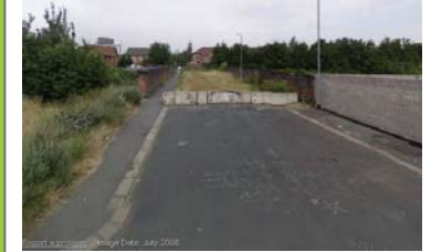
Cross Green Lane