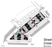
Street Cross Elevation

5 development sites exist in the area, including one resulting from an acquisition & demolition programme that will be completed in 2013/14.